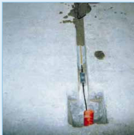
Optical Strand post-installed in mortar.