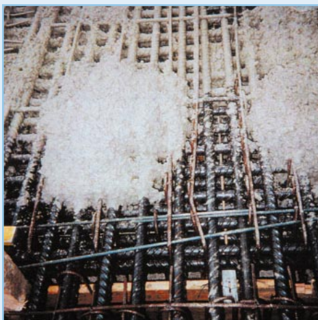
Optical Strand during concrete pouring.