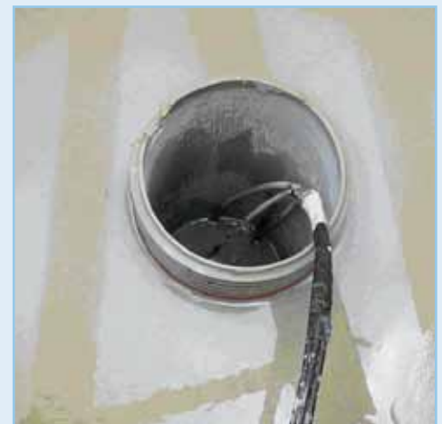
Optical Strand in injected bores.