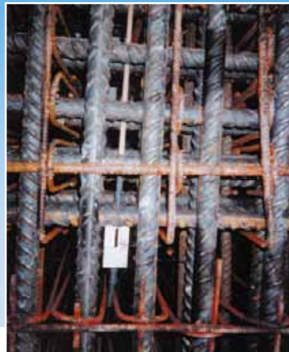
Optical Strand in a reinforcing cage.